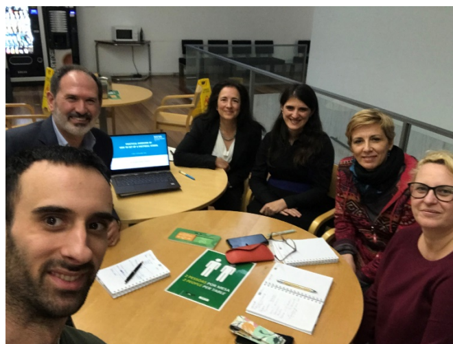
Meeting with representatives of UNL Doctoral School