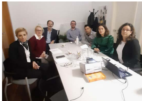
Meeting at IRIS Office - knowledge valorization facilitator at FCT