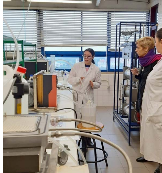
Presentation of METCell and Osmonics installations at FCT