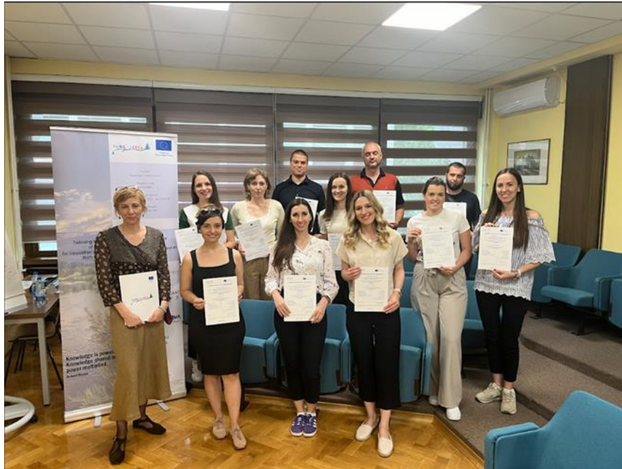
At the very end of the 2 nd TwiNSol-CECs Summer School after the certificates award