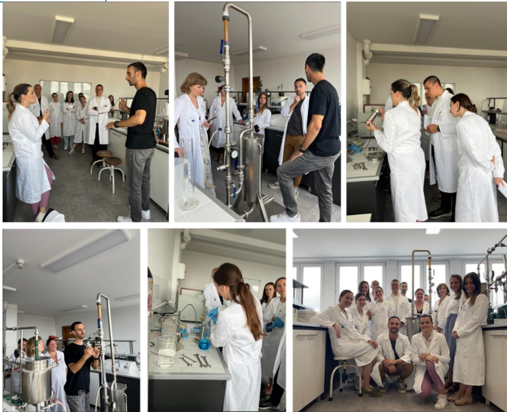
The first Practical lessons of 2 nd Summer School