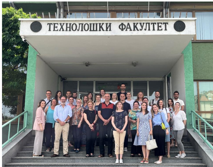
Participants and organizers of the 2 nd Summer school in front of TFNS