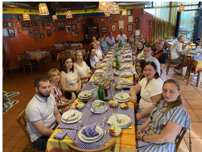
Official dinner for the registered participants, lecturers, and the Organizing Committee members