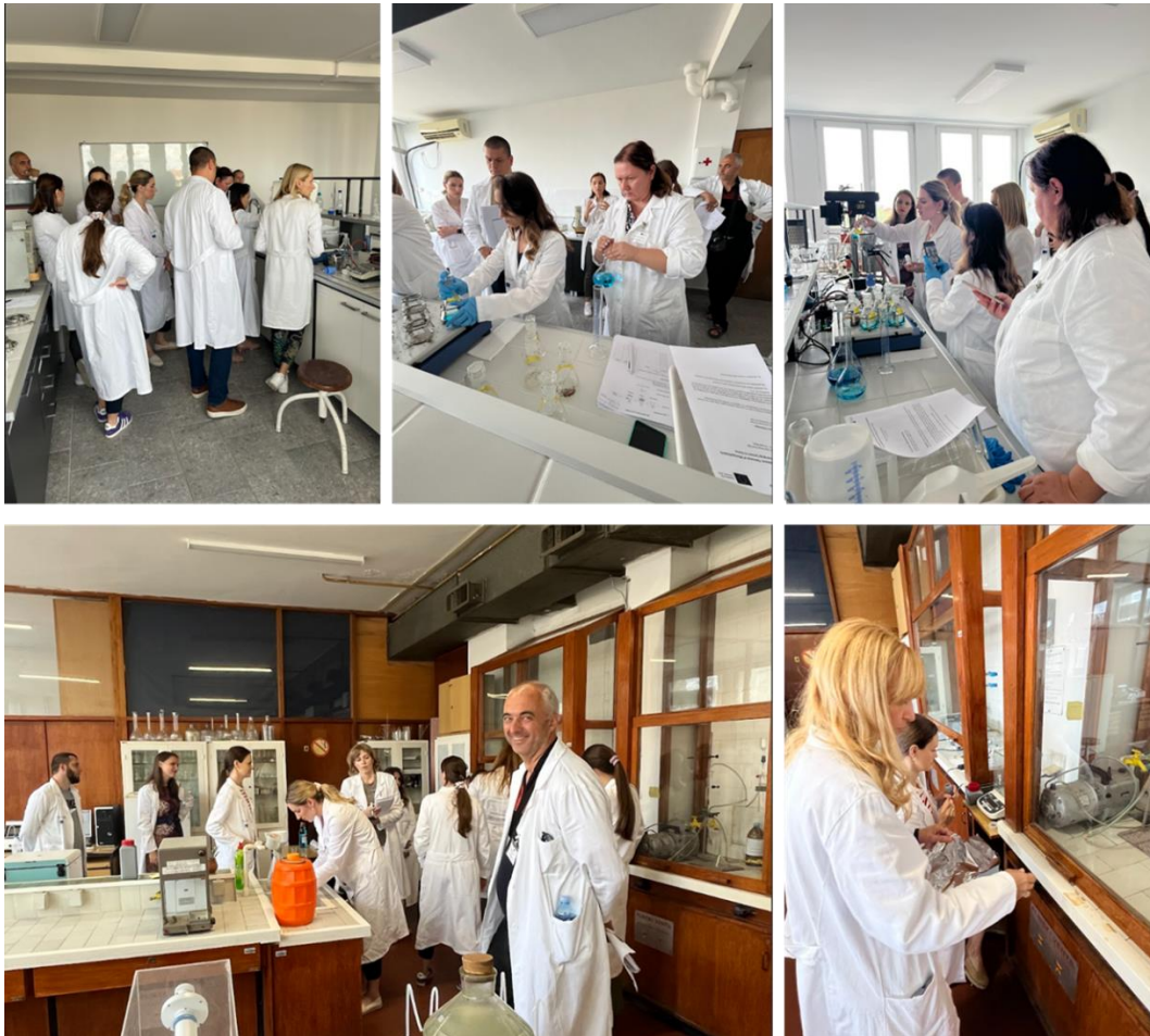
The second Practical lessons of 2 nd Summer School